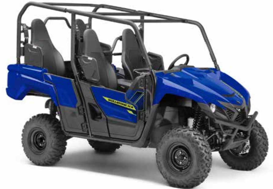
Wolverine X4 - Racing Blue