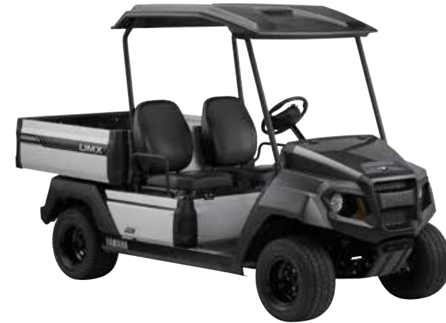
UMX - Carbon