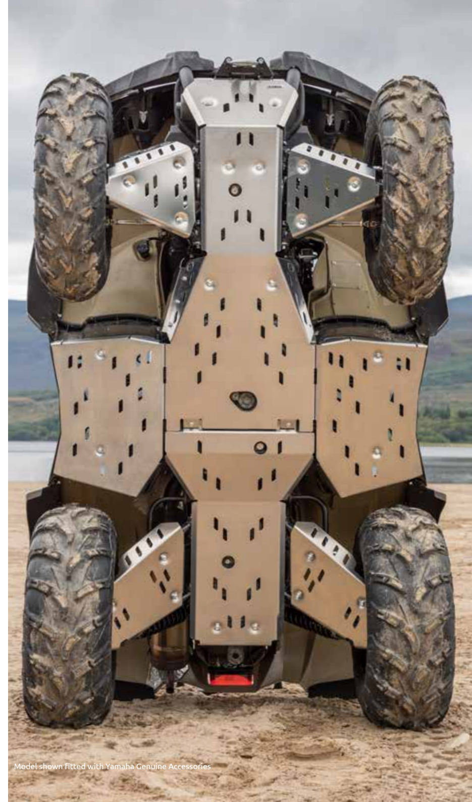
Model shown fitted with Yamaha Genuine Accessories