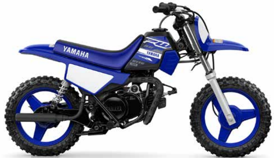
PW50 - Racing Blue

At just 39 kg, this lightweight and compact mini-bike is the ideal way for your child to have hours of fun while developing their riding skills.