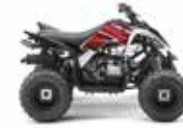
YFM90R - White