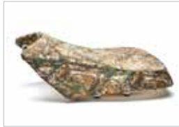
Camo Seat Cover