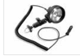
Spot Light Kit