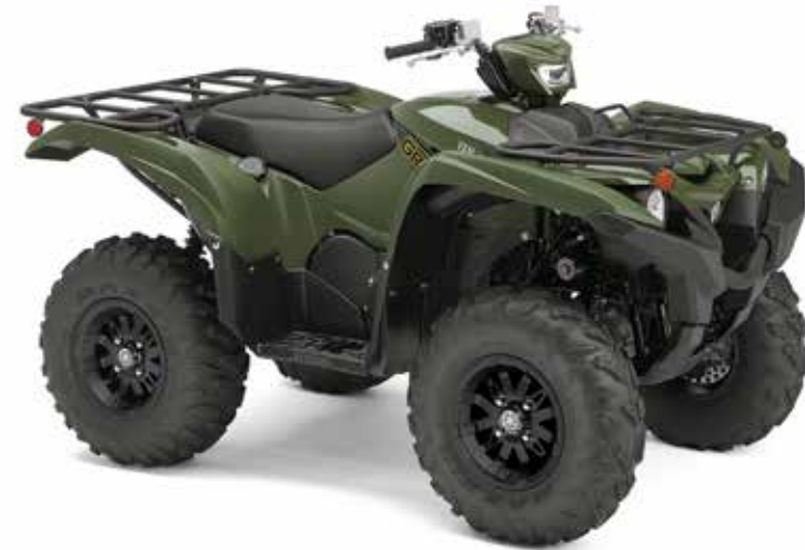
Grizzly 700 EPS / ALU - Olive Green