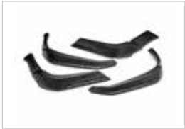
Over Fender Kit