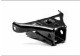
2" Receiver Kit

We've created a diverse range of quality accessories engineered specially to fit your ATV or Side-by-Side. You can expect the same level of quality and performance that goes into every Yamaha product we build. So whether you use your Yamaha ATV or Side-by-Side for work, leisure or competition, have just one or several Yamaha's, there's a Genuine Accessory that's right for you.