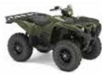
GRIZZLY 700 EPS / ALU / XT-R