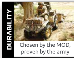
Chosen by the MOD, proven by the army

the difference between getting the new ATV you want or getting an ATV on a budget. More money for your used Yamaha ATV means a bigger deposit for your new ATV and you can think about the accessories or the EPS you wanted.