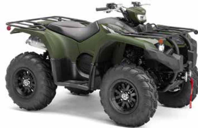
Kodiak 450 EPS ALU - Olive Green