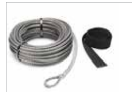
Synthetic Rope Kit