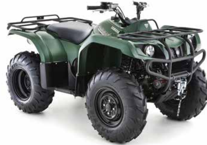
2WD / 4WD - Pastel Deep Green