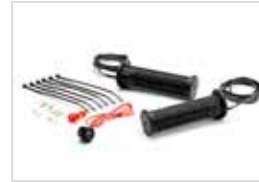
Grip Heater Kit