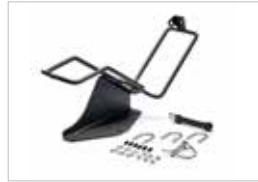
Gun Boot Holder