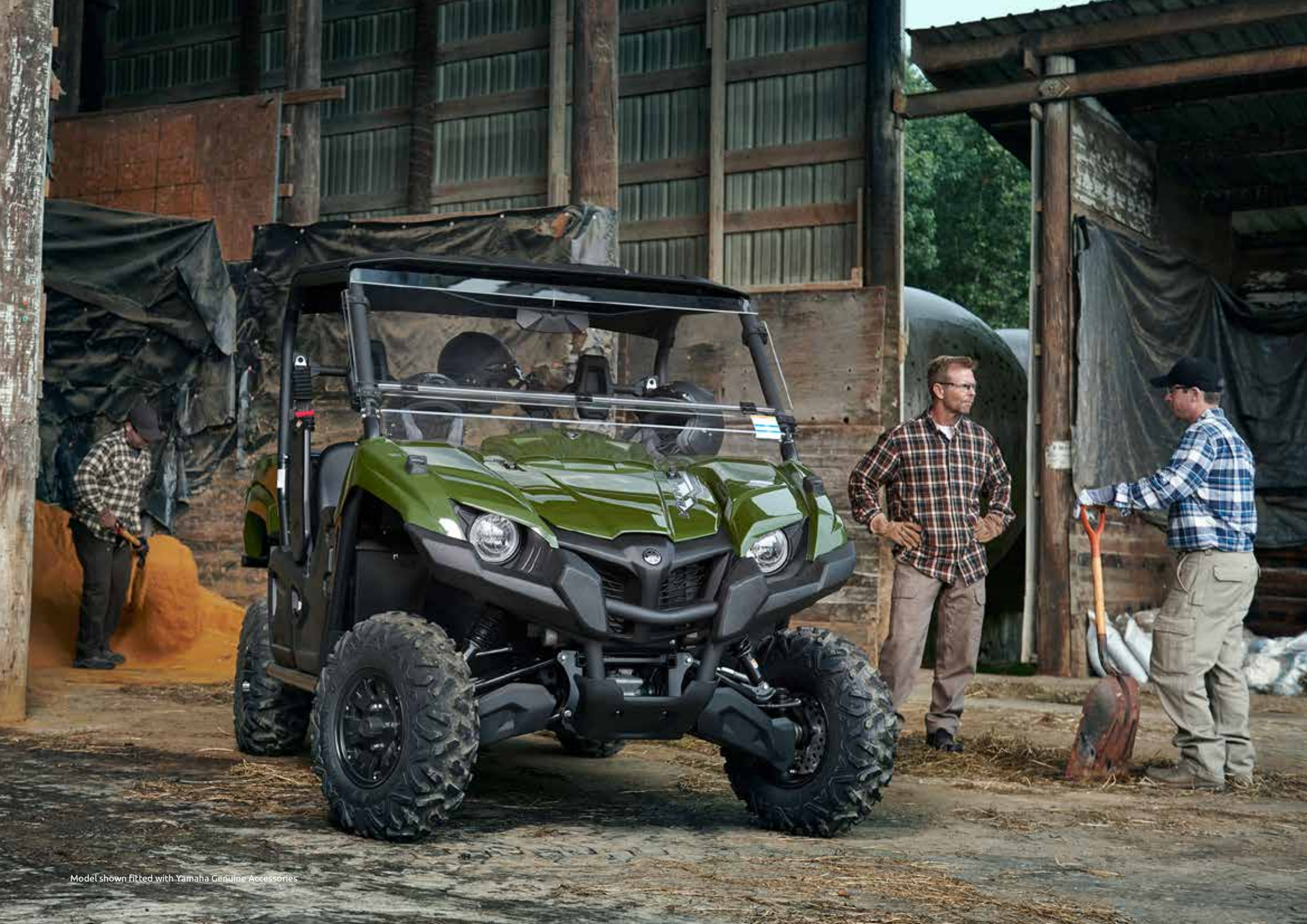
Model shown fitted with Yamaha Genuine Accessories