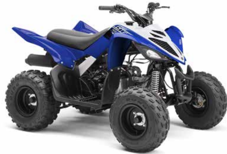
YFM90R - Racing Blue