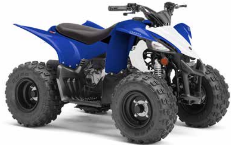
YFZ50 - Racing Blue