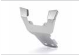
Front Bash Plate