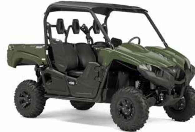
Viking EPS - Olive Green