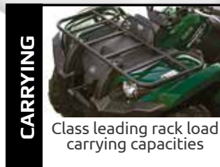
Class leading rack load carrying capacities

tension – a significant factor for durability - plus a sprag clutch that delivers full engine braking on downhill descents. Ultramatic® has been proven to be the most durable CVT transmission available on an ATV, and you don’t have to take our word for it – just check online+0 for independent reports.