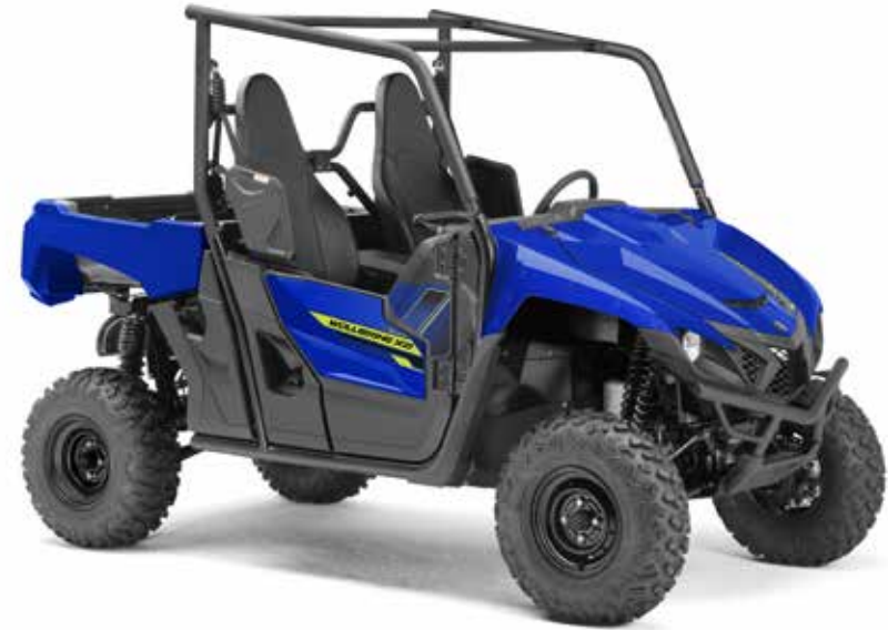
Wolverine X2 - Steel Blue