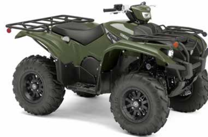
KODIAK 700 EPS / ALU - Olive Green